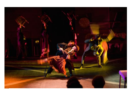
Theater Grottesco, Fortune, 2007.

tickets@theatergrottesco.org 505.474.8400