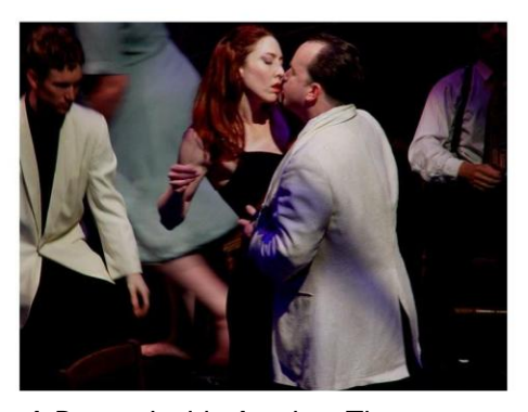
A Dream Inside Another, Theater Grottesco and Sideshow Physical Theater, 2005.

Funded by The National Endowment for the Arts, New Mexico Arts: a division of the Office of Cultural Affairs, The City of Santa Fe Arts Commission and the 1% Lodger's Tax, and the New Mexico Tourism Department.